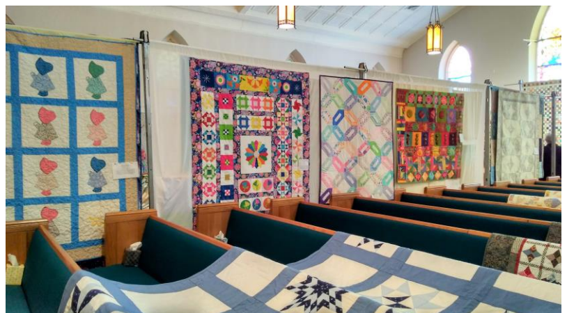
Threads of Love, special exhibit