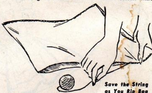
Save the String as You Rip Bag

One reader has made a crocheted tea cloth out of the string she saves when she rips the cotton bags that come into her home. The bag is sewn with a chain stitch that