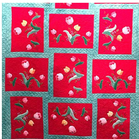
Vintage hand stitched placemats