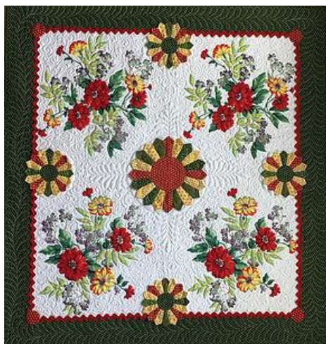
Vintage tablecloth with added Dresden plates