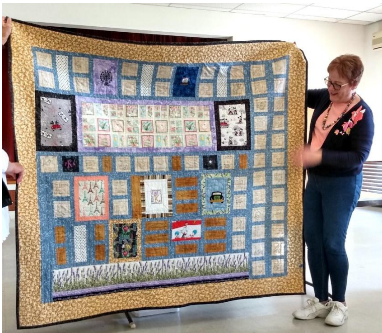
This side has numerous signed messages, mementos and reminders of the wedding.