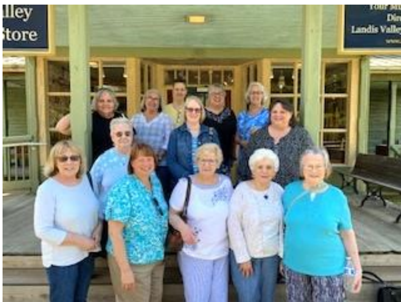
The gang on the steps of the Landis Valley Museum Store.

On a sunny spring day last week, fourteen LTQ members set off for Lancaster County for a Lititz Do-Over. (Quite the contrast in weather conditions from our first try in late January when a snowstorm changed our plans dramatically!) First stop was Wilber Chocolate Factory (a renegade group couldn't resist a stop at nearby Weaver's for a fabric fix). On to lunch at S. Clyde Weaver's where we all got our 'passport stamps' for that day's adventure. The trip highlight, without a doubt, was our afternoon visit to Landis Valley Farm Museum to relive life in the 1700s and 1800s.