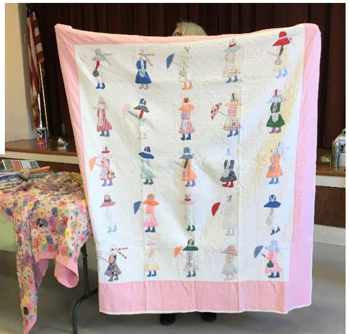
Items made from feed sacks