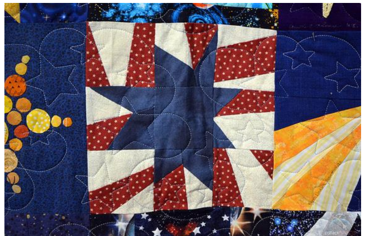
First quilt block made in space by astronaut Karen Nyberg!