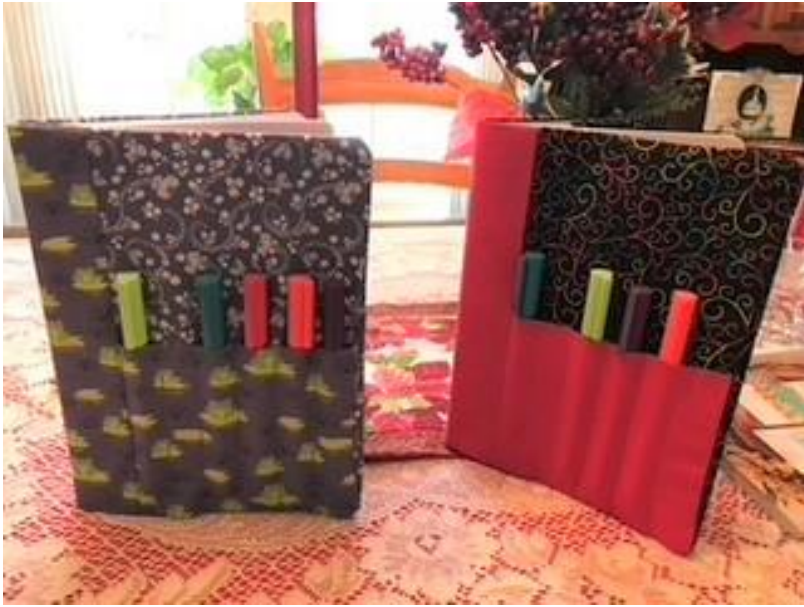
Pat Leiter - These are Christmas gifts for two preteen girls. The plain composition books - I covered them and added a few gel pens. What girl doesn't like to journal or draw or just doodle? I got the idea from Pinterest.