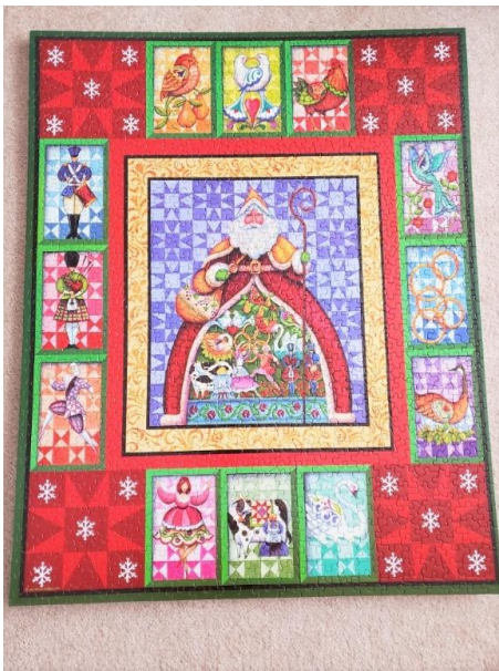
Marylou Boryta – This is a Jim Shore puzzle that I finished and had dry mounted. Still needs a frame, but will hopefully get done in 2021.