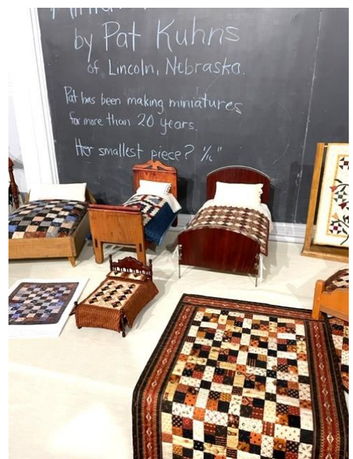
Missouri Star Museum Note the smallest piece.