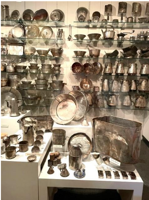
Objects from the sunken Arabia