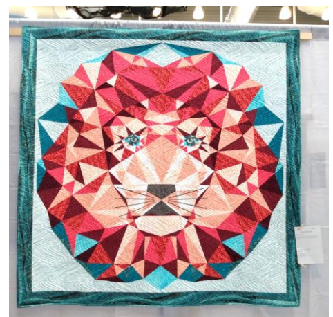
This striking quilt was made using a Violet Crafts Jungle Abstractions foundation pieced pattern