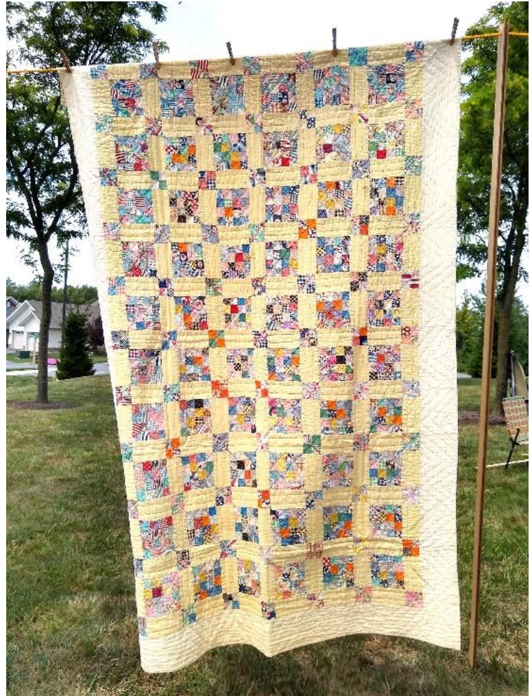
Susan's photos from last year's display