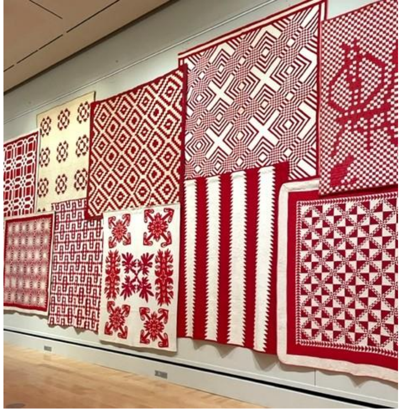
The International Quilt Museum at the University of Nebraska–Lincoln in Lincoln, Nebraska is the home of the largest known public collection of quilts in the world.