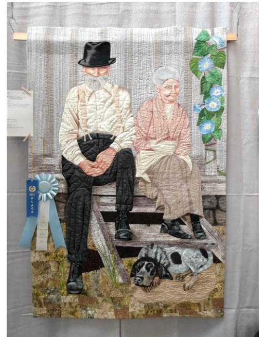
This amazing pictorial quilt was judged Best of Show