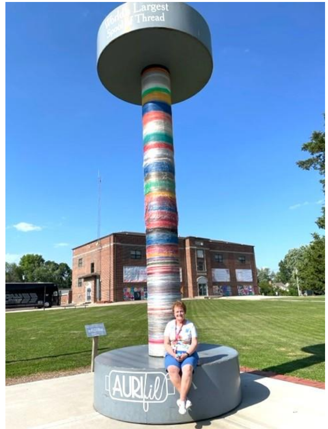
World's largest spool of thread – At 97 degrees, I didn't sit very long.