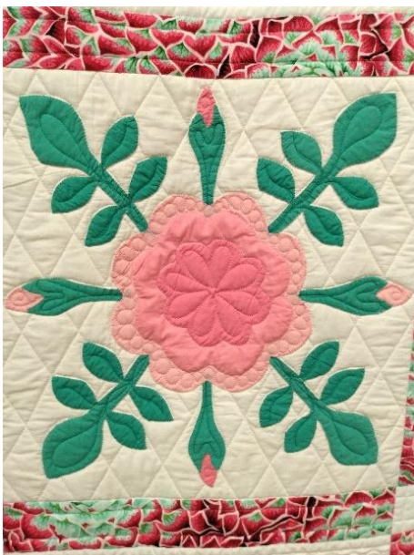
Vintage quilt was disassembled and remade using contemporary fabric and a new design.

We enjoyed a delicious lunch (with some scrumptious desserts!) at the nearby restaurant, The Cove, recommended by one of the York guild members.