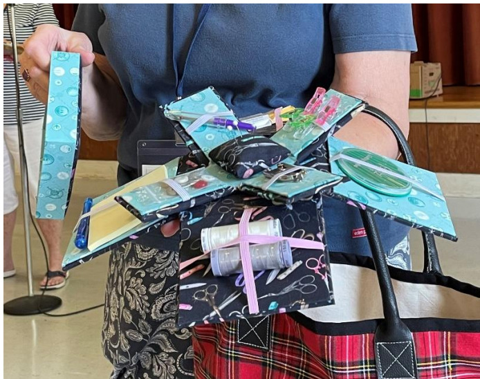
Josie Sharp made this terrific sewing box that opens to reveal numerous storage sections.