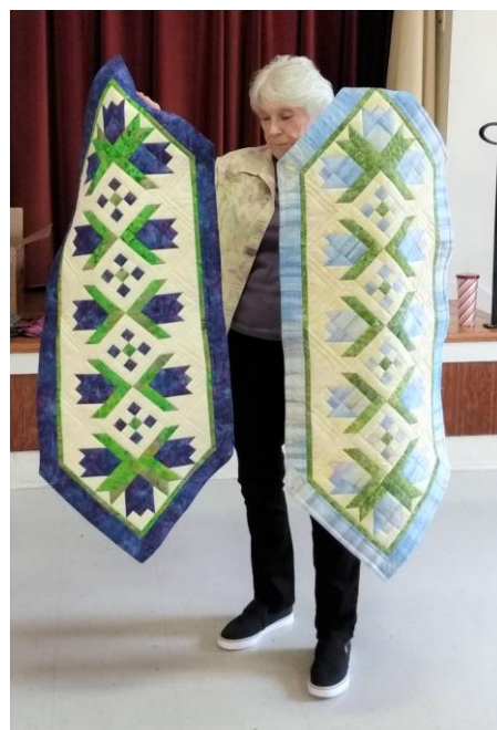
Carolyn's table runners