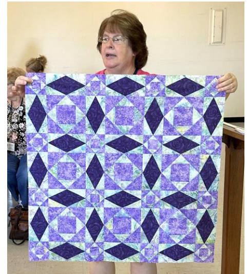
Laurie Kelly's Storm at Sea