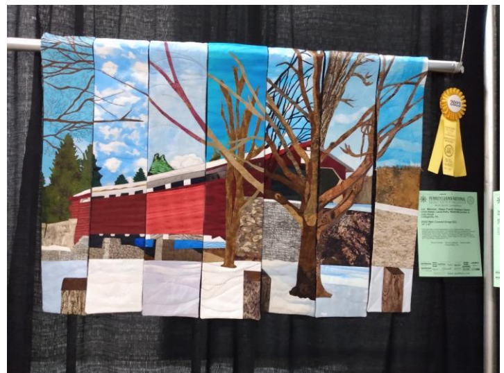
Group Effort - Fractured Quilt