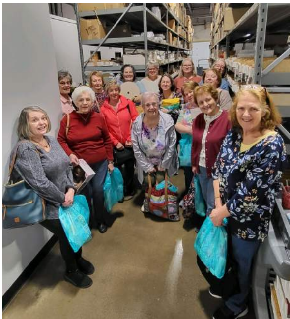
Loose Threads Quilters enjoyed a fun trip to Home Sew Warehouse