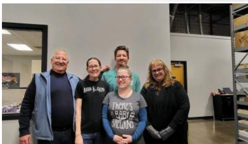
These were the gracious hosts for LTQs visit to Home Sew Warehouse